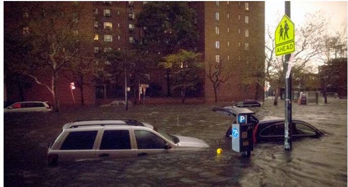
Flooding caused by Hurricane Sandy had devastating consequences for New York City, particularly for its low-income residents. xxvii

Hurricane Sandy was a moment of truth for New York City, demonstrating that the climate crisis is also about a crisis of inequality. Fifty-five percent of the storm surge victims in New York after Hurricane Sandy were very low-income renters, whose incomes are $18,000 a year on average. xviii At the same time, those with excess wealth were able to leave the city, rent hotel rooms and in some cases bring domestic workers with them to care for their children. xix While some neighborhoods in New York City are still being rebuilt three years after Sandy, Wall Street's Stock Exchange was up and running within two days of the storm. xx Finally, public dollars are called upon to pay for much of the damage wrought by climate disaster, which in turn diverts much needed resources from low-income communities.