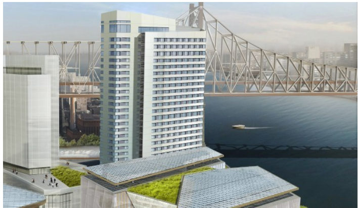
A rendering of Cornell University's Tech Campus on Roosevelt Island in NYC, which will be the world's first Passive House high-rise. It will open in 2017. xxiv

High-performing buildings that use energy intelligently and responsibly are achievable today. Proven models, effective technologies, and a diversity of strategies exist now. For example, several multi-family residential buildings in New York City are being built and retrofitted to "passive house" standards. xxvi Passive homes require no active heating or cooling systems and use about one-quarter of the energy of a typical home. The problem is that many more buildings are being built and renovated with no concern for carbon emissions. The private real estate market will not adequately address the climate crisis, and the city must step in to take the lead.